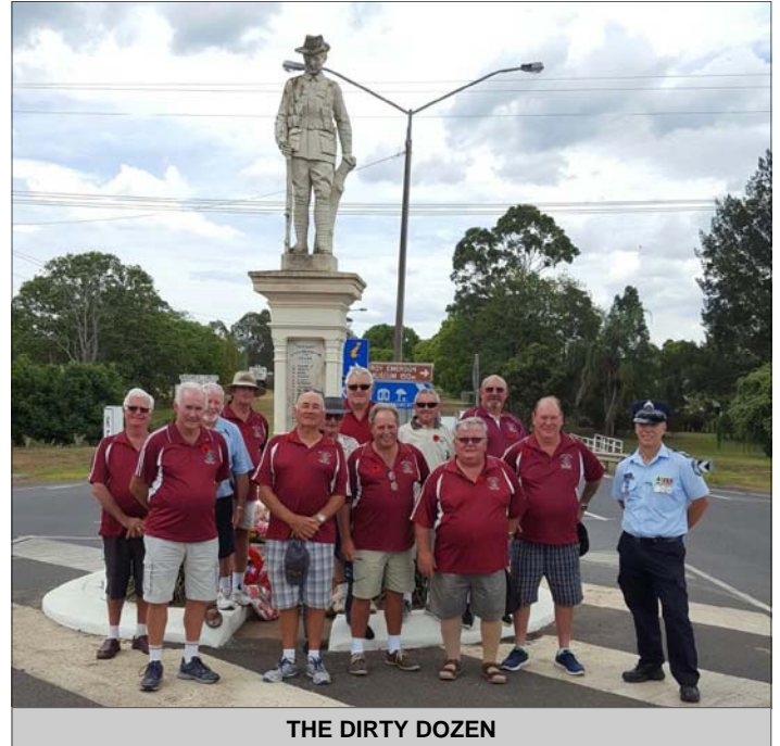
THE DIRTY DOZEN

Friday 25 th November was our Combined Services Day, we had 54 players and a great BBQ after the game. The Army won the day easily from the Navy and Air Force.